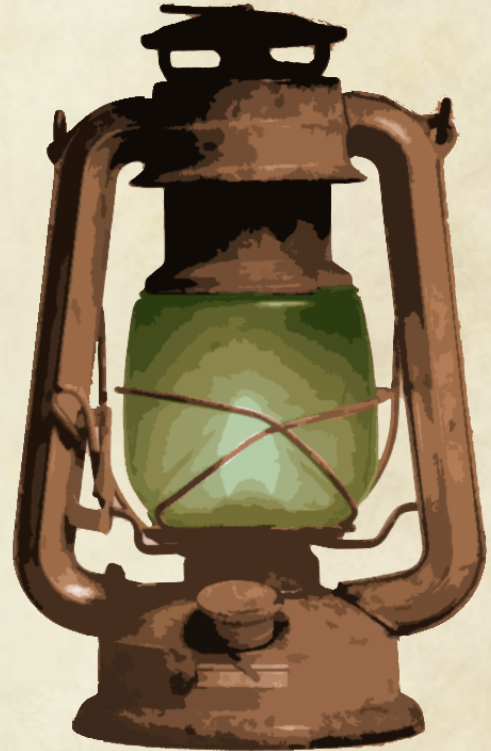
LANTERN-SOUL OF THE FIRST

You may also use an action to place the key inside the shambling mound, at which point it opens up and safely consumes you. While there, you have total cover against attacks and other effects originating outside of it. By expending 5 feet of movement you may voluntarily leave the mound. If the shambling mound dies or you willingly leave it, you appear to the nearest unoccupied space within 5 feet of it.