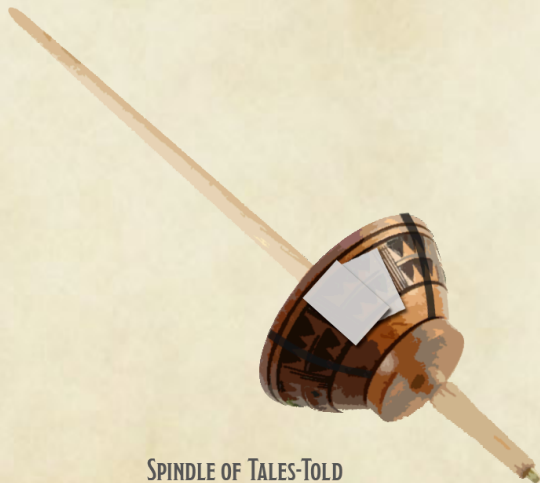
SPINDLE OF TALES-TOLD

This unassuming shipping crate, created by the Rivington Rats, serves two unique purposes. You may speak a command word to make all contents inside the crate either weigh half or double their natural weight.